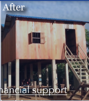
Look what your financial support helped build